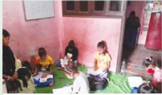
Children are studying at Centre